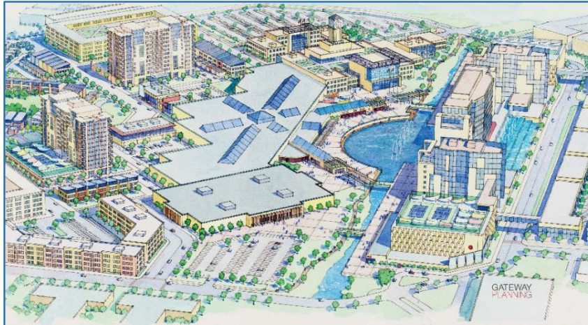
Collin Creek Village (Mall Retrofit)